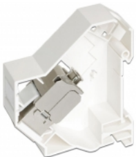
Anwendungsbeispiel mit Stecker