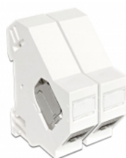
Anwendungsbeispiel mit Stecker