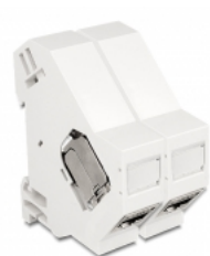
Anwendungsbeispiel mit Stecker