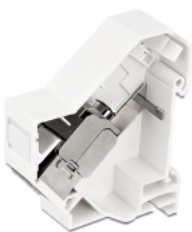
Anwendungsbeispiel mit Stecker